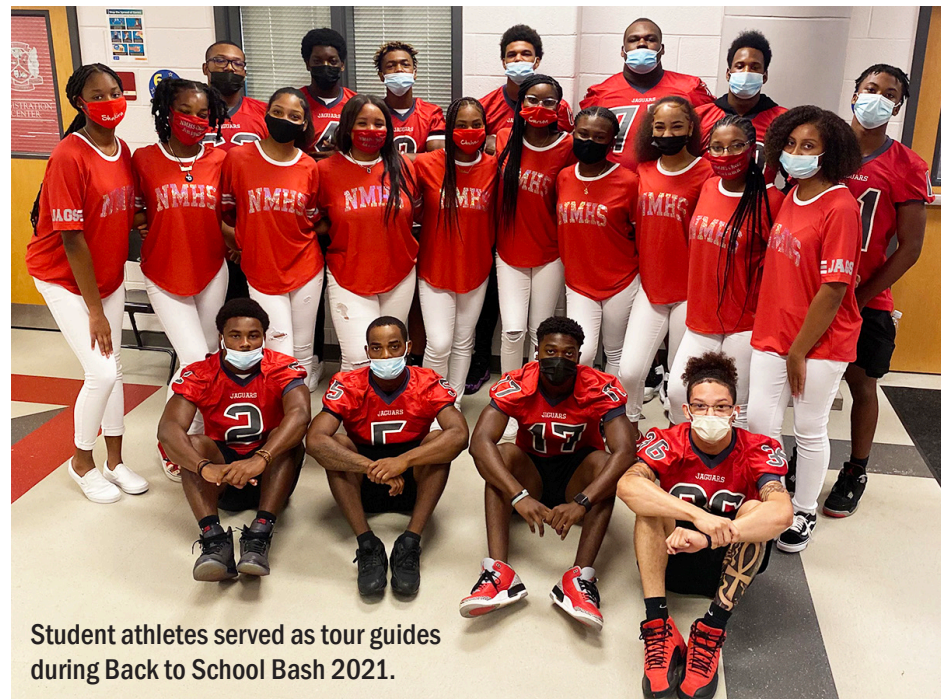
Student athletes served as tour guides during Back to School Bash 2021.